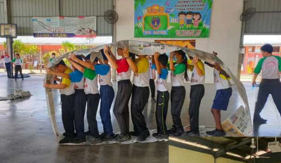
“The Human Caterpillar” game.