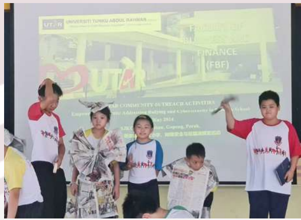
The Newspaper Fashion Show's models on the stage.