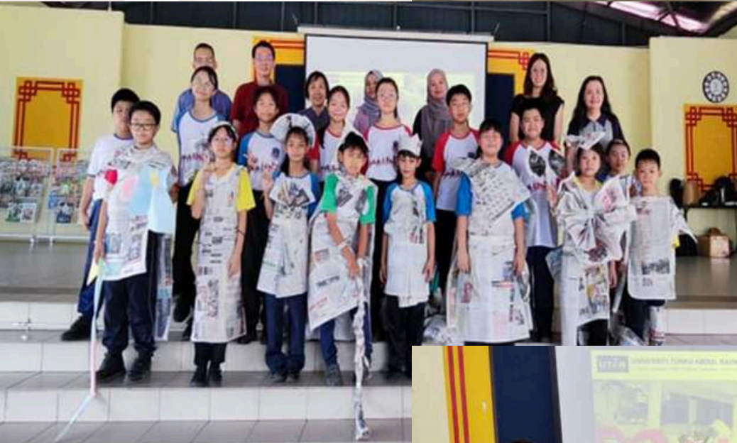
Newspaper Fashion Show’s participants